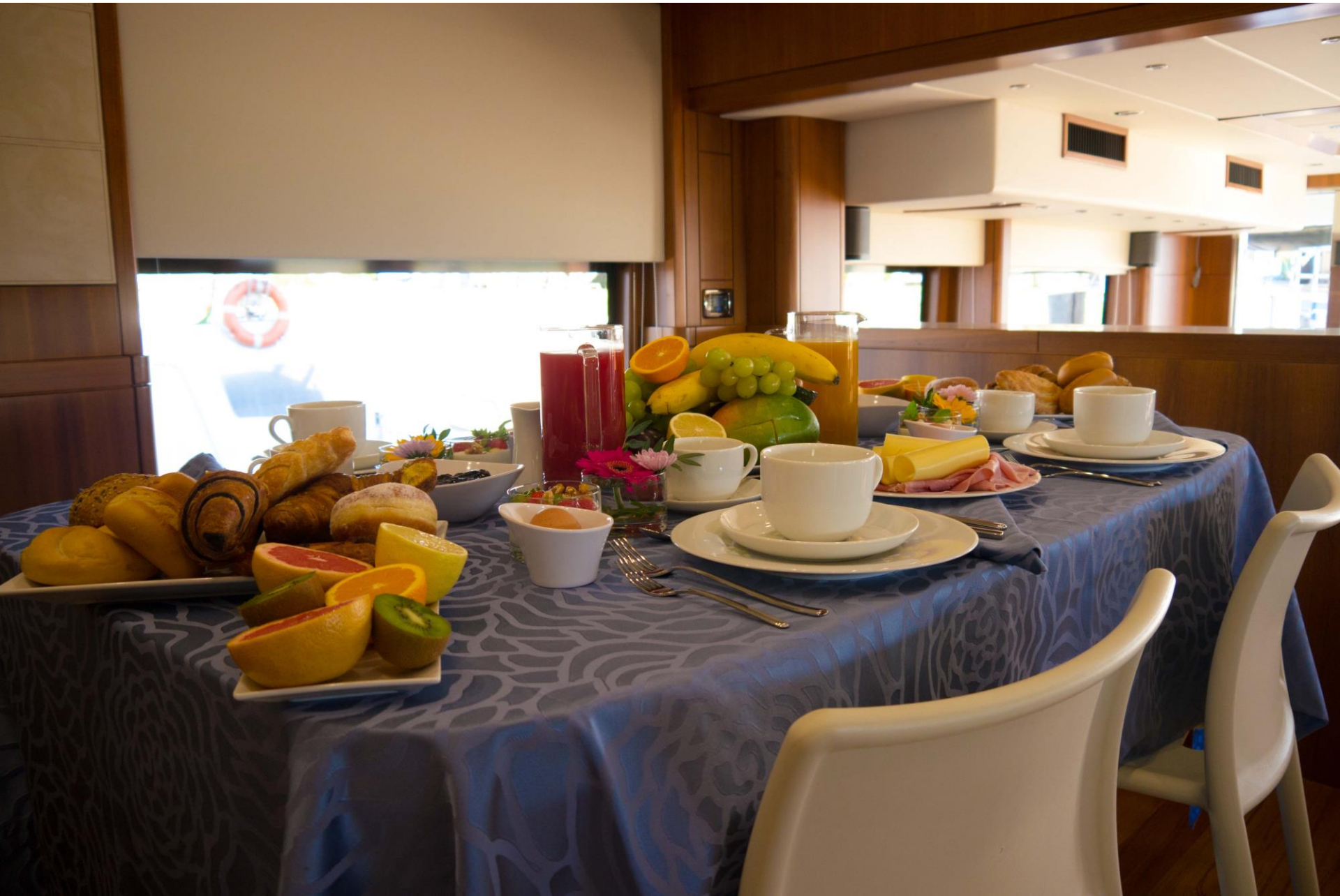
Table set for breakfast