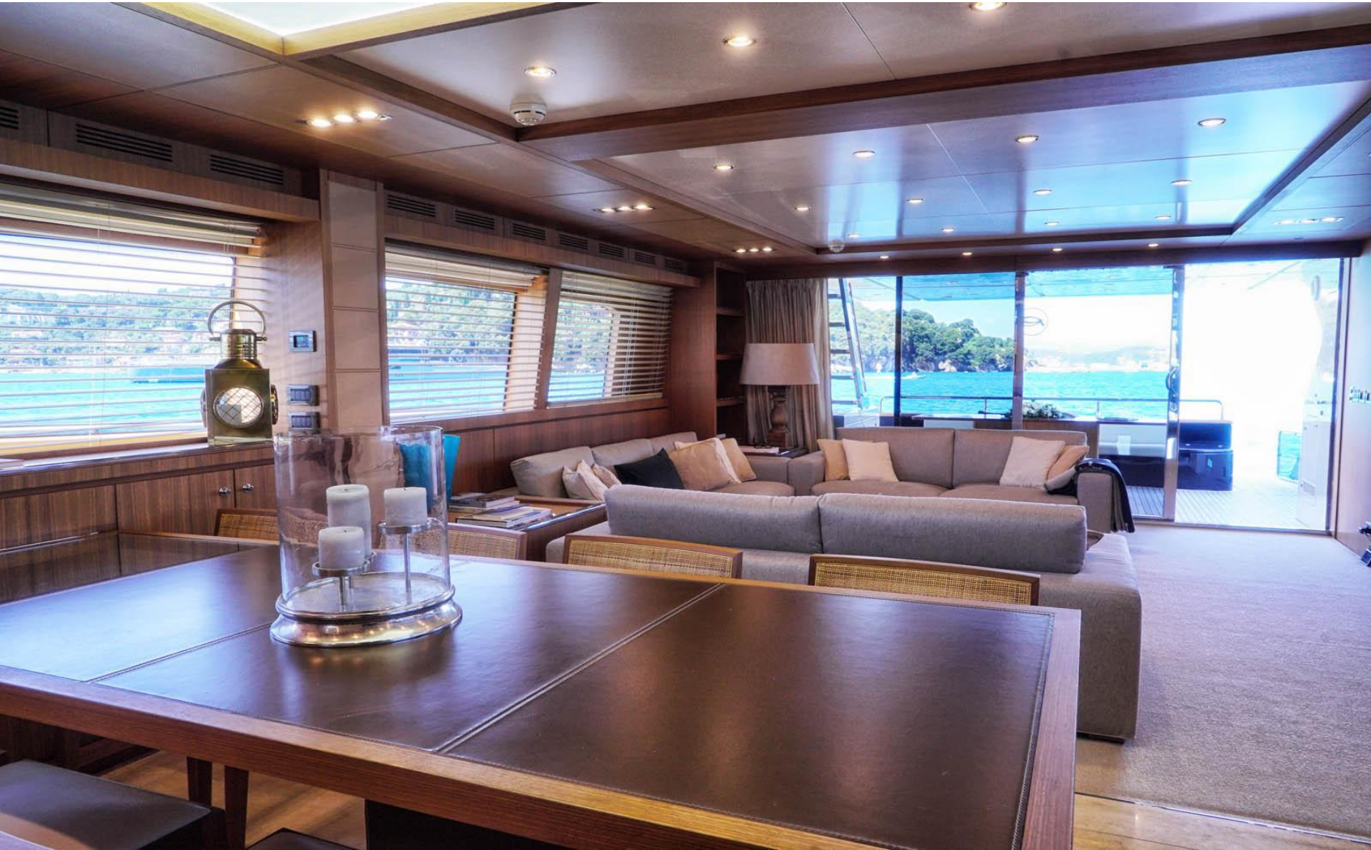
Salon further view