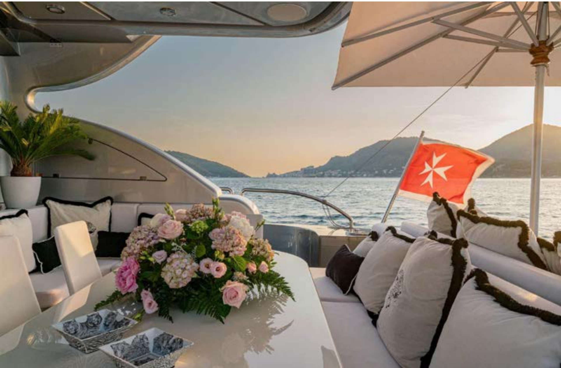
Astern Cockpit View